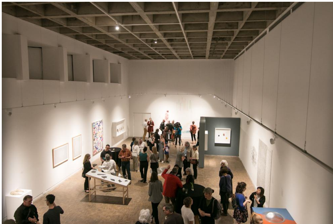
Opening Reception of First You Dream: Celebrating 75 Years of the Nova Scotia Talent Trust , May 25, 2019