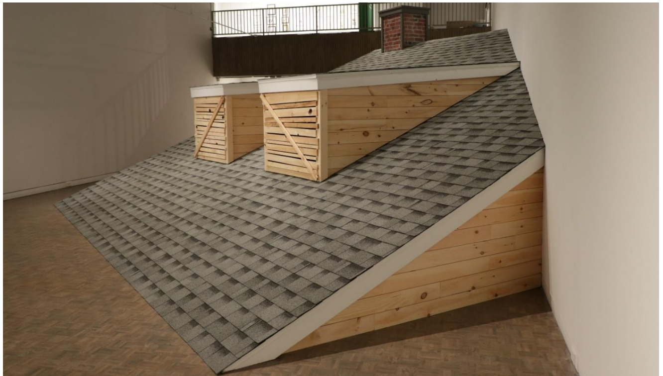
Heather Hart: Northern Oracle (installation view) 2020

This exhibition ended early due to MSVU Art Gallery’s closure in response to COVID-19 restrictions.