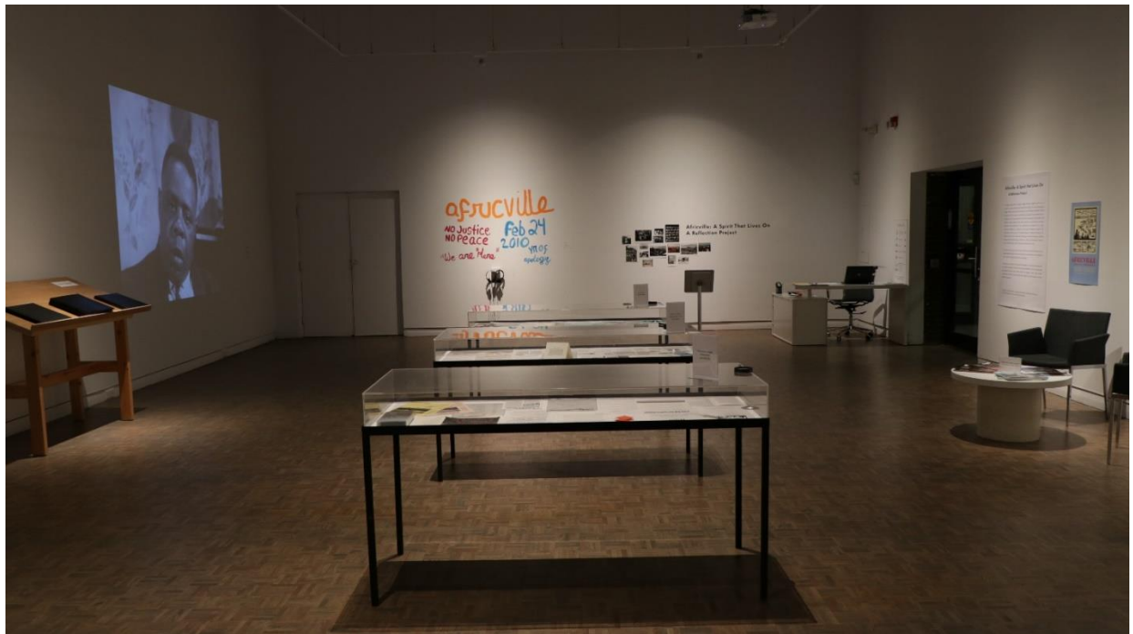
Africville: A Spirit That Lives On — A Reflection Project (installation view) 2019