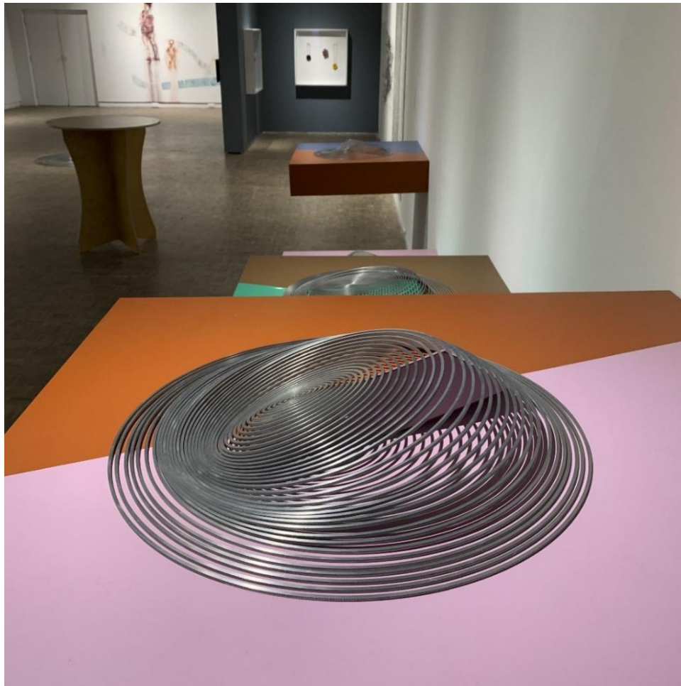
First You Dream: Celebrating 75 Years of the Nova Scotia Talent Trust , installation view, 2019

The Nova Scotia Talent Trust and partner galleries recognized the support of the Province of Nova Scotia through the Department of Communities, Culture and Heritage.