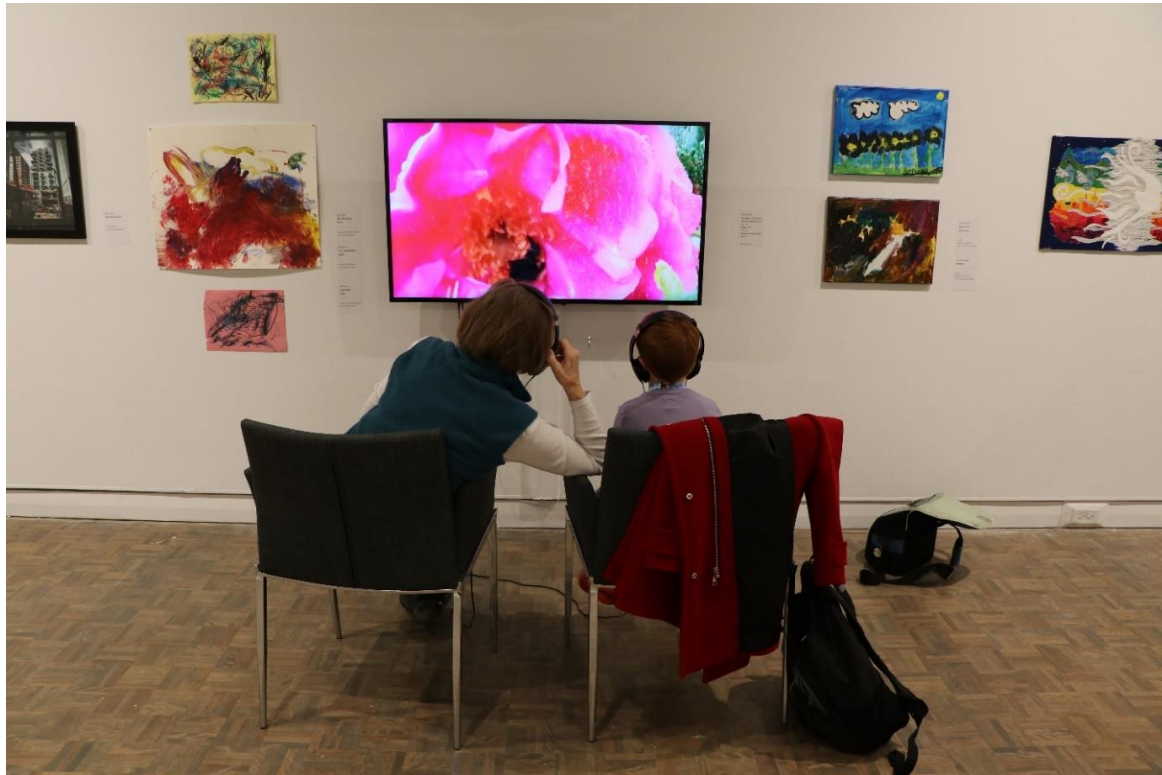
Annual Mount Community Show, Opening Reception, 2019

Mount Saint Vincent University students, staff, faculty, alumnae and their families were invited to display their creative work in this annual extravaganza.