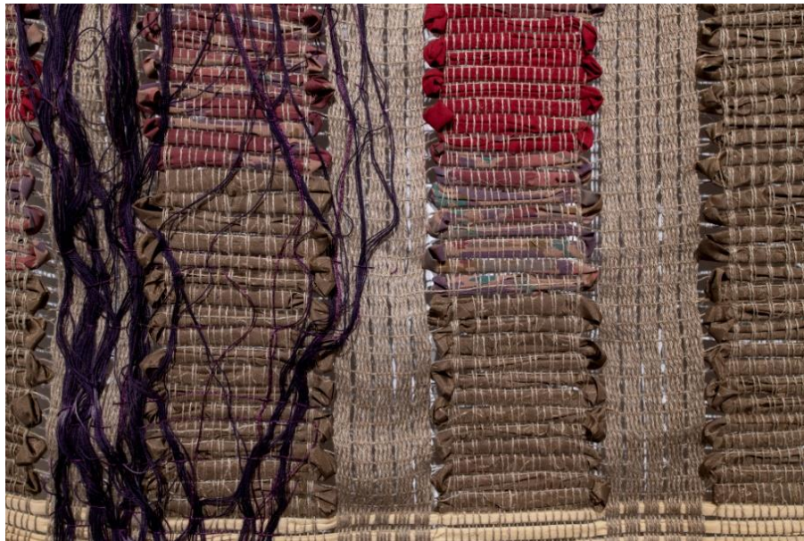
Christiane Poulin, Echo 4: Growth 2018 (detail)