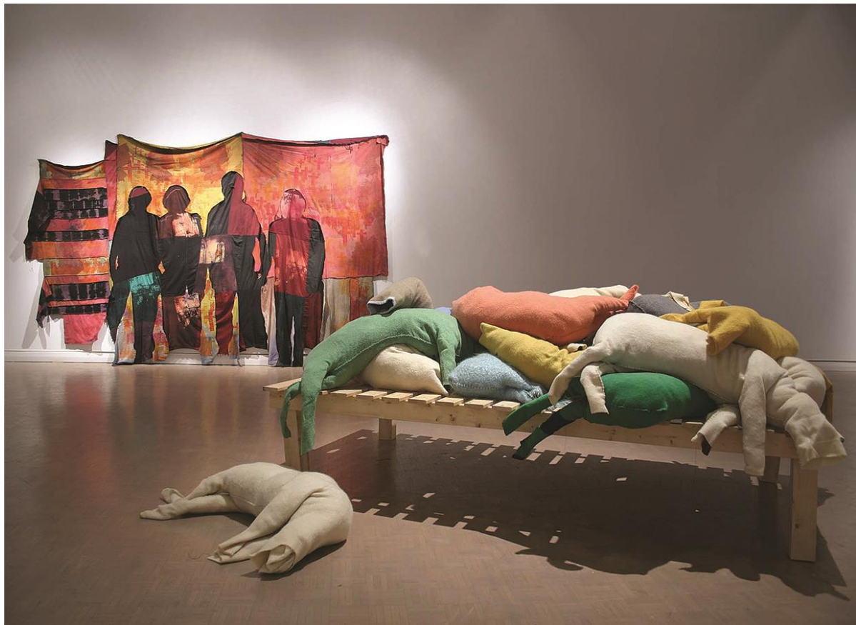
Big in Nova Scotia (installation view) 2014

Wolf continues to maintain an active art practice out of the collective studio spaces located above the Halifax Army Navy Store. In March, 2015, she performed in Circus of the Spectrum , a fundraiser for White Rabbit Open Air Artists' Residency.