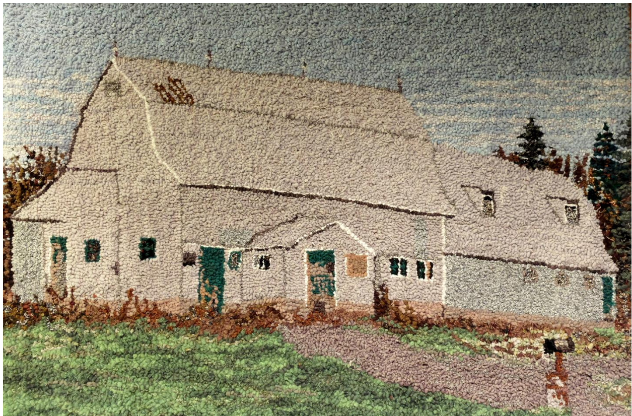
Joanna Close, The Barn 2012

Mount Saint Vincent University students, staff, faculty and alumnae were invited to enter up to three examples of their creative work in the annual extravaganza. All mediums were welcome (visual art, music, performance, poetry, craft, literary, basketry, beading, baked goods, etc.).