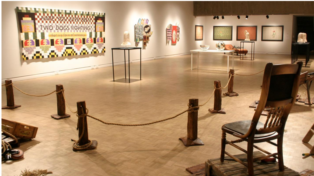
Making Otherwise: Craft and Material Fluency in Contemporary Art (installation view) 2014

Staff. "Sure thing: Big in Nova Scotia." The Coast Sept 2014. http://www.thecoast.ca/halifax/big-in-nova-scotia/Event?oid=4392737