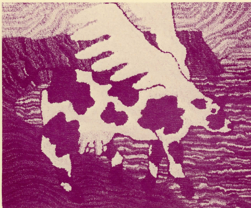
Edell, Nancy Blomidon Cow 1981 Permanent collection